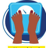
Unexplained weight loss