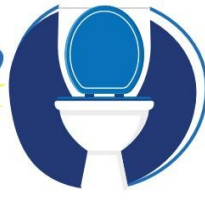
Changes to poo