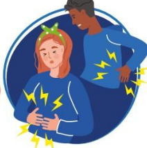
Tummy / back pain